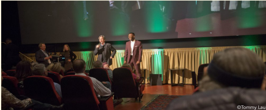
An opening night screening at the Mill Valley Film Festival.